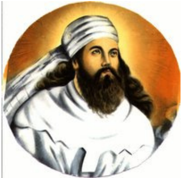
Zoroaster: Prophet of Ancient Persians

Today there are still about 65,000 Parsees, with about 60,000 living in the Mumbai area. Since both parents must be Parsees for someone to be a Parsee, and since it is not possible to covert to Zoroastrianism, all of today's Parsees can directly be traced back to the original Persians.