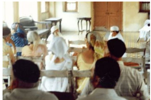
The two figures sitting on the floor in white are the priests.

Below a photo of a Parsee religious ceremony in the fire temple in Mumbai, taken by Dr. Schweizer. (They let him in, despite the rules against it)