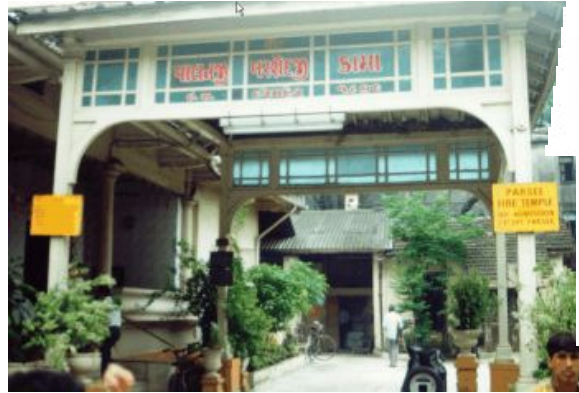
Parsee temple in Mumbai

The Parsees in India are part of the cultural and intellectual elite. They have their own hospitals, schools, and well kempt "gated" housing areas.